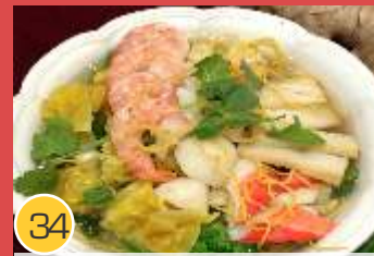
34 Seafood Wonton Mein $11.50

Thick egg noodle, combination seafood, tofu, vegetable, coconut curry soup