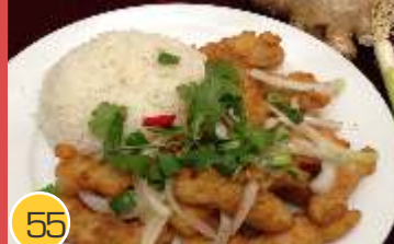
55 Salt & Pepper Chicken $10.50 Deep fried chicken, salt & pepper