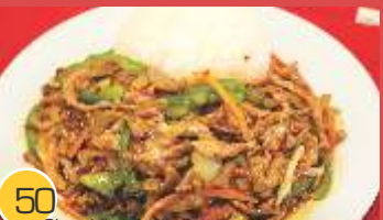
50 Shredded Pork in Special Chilli Sauce $10.50 Pork, Vegetable, chilli sauce, served with steam rice.