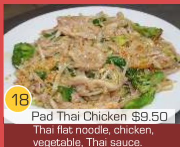
18 Pad Thai Chicken $9.50 Thai flat noodle, chicken, vegetable, Thai sauce.