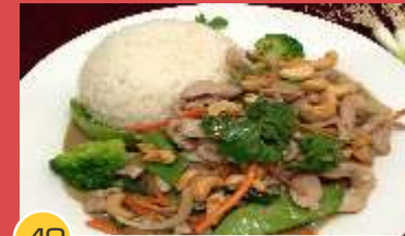
48 Chicken Cashew Nut $10.50 Chicken, cashew nut, vegetable