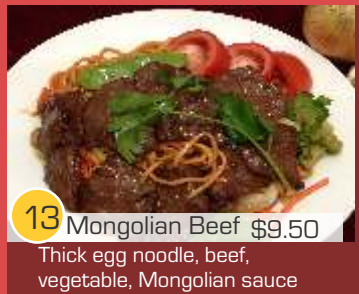
13 Mongolian Beef $9.50 Thick egg noodle, beef, vegetable, Mongolian sauce