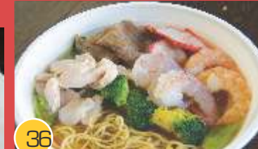
36 Combination Soup $10.50

Thin egg noodle, won ton, chicken, vegetable, chicken soup