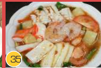
35 Tom Yum Seafood Soup $10.50

Thin egg noodle, won ton, prawn, calamari, fishcake, veggies, chicken soup