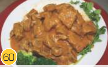
60 Thai Curry Beef Rice $11.50 Beef, Thai curry sauce, vegetable