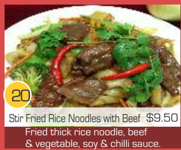
20 Stir Fried Rice Noodles with Beef $9.50 Fried thick rice noodle, beef & vegetable, soy & chilli sauce.