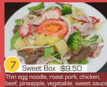
7 Sweet Box $9.50 Thin egg noodle, roast pork, chicken, beef, pineapple, vegetable, sweet sauce