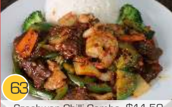
63 Szechwan Chilli Combo $11.50 Combination meat, vegetable, Szechwan chilli sauce