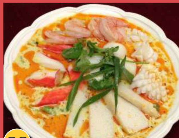
32 Seafood Laksa $10.50

Thick egg noodle, combination seafood, tofu, vegetable, coconut curry soup