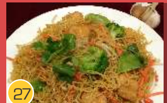
27 Vegetarian Oyster Noodle $8.00

Thai flat noodle, seafood, vegetable, Thai sauce