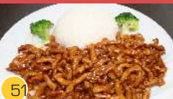
51 Shredded Pork in Peking Sauce $10.50 Pork, spring onion, Peking sauce