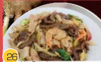
26 Xo Combo Fried Kuai Teow $10.50

Udon noodle, beef, vegetable, Szechuan chilli sauce