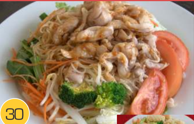
30 Thai Curry Chicken $9.50

Thick rice noodle, prawn, beef, pork, chicken, vegetable, Xo sauce