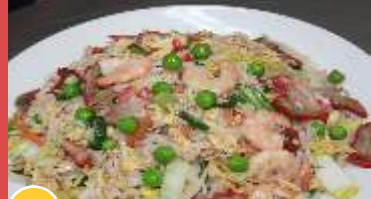
42 Special Fried Rice $9.50 Shrimp, roast pork, carrot, peas, onion, bean shoots