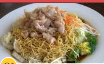
21 Honey Soy Chicken $9.50

Thin egg noodle, chicken, vegetable, honey soy sauce