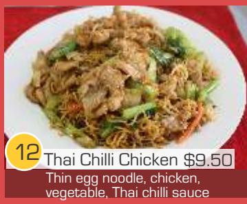
12 Thai Chilli Chicken $9.50 Thin egg noodle, chicken, vegetable, Thai chilli sauce