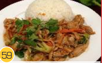
59 Thai Chilli Chicken Rice $10.50 Chicken, onion, Thai chilli sauce