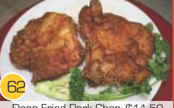
62 Deep Fried Pork Chop $11.50 Deep fried pork chop, lemongrass, soy sauce, served with steam rice.