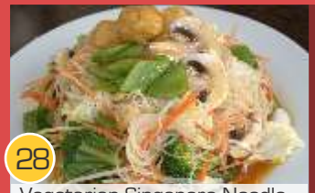
28 Vegetarian Singapore Noodle $8.00

Thin egg noodle, tofu, mushroom, vegetable, oyster sauce