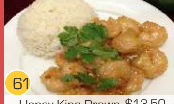
61 Honey King Prawn $13.50 Fried king prawn in honey soy sauce