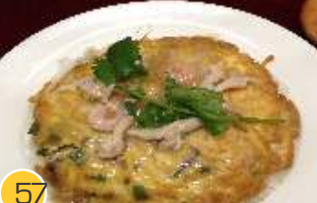
57 Combination Omelette $11.50 Combination meat, egg, spring onion