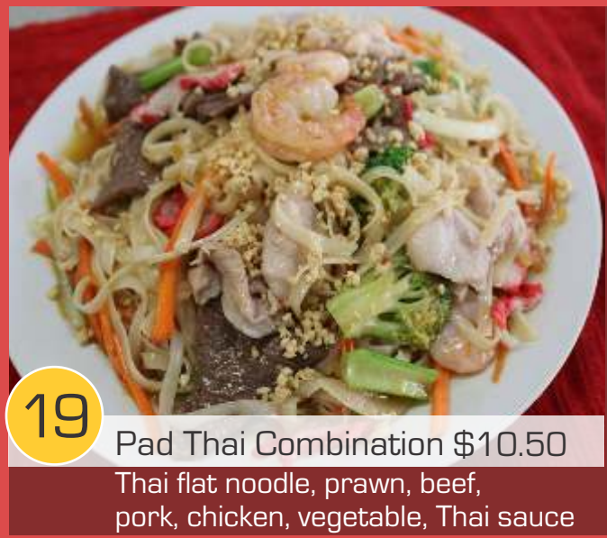
19 Pad Thai Combination $10.50 Thai flat noodle, prawn, beef, pork, chicken, vegetable, Thai sauce