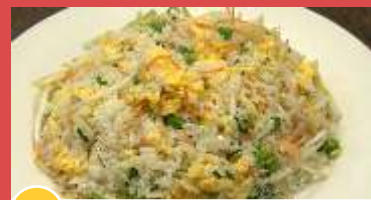
40 Egg & Vegetarian Fried Rice $9.50 Egg, bean shoots, onion, carrots, spring onion, peas, oyster sauce