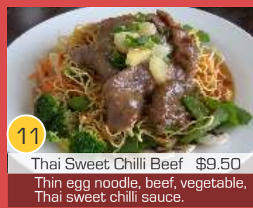
11 Thai Sweet Chilli Beef $9.50 Thin egg noodle, beef, vegetable, Thai sweet chilli sauce.