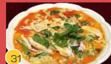
31 Chicken Curry Laksa $9.50

Thin rice noodle, combo seafood, tomato, pineapple, vege, Thai hot & sour soup