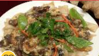
22 Beef Scramble Egg $10.50 with Fried Rice Noodle

Thin egg noodle, chicken, vegetable, honey soy sauce