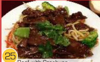
25 Beef with Szechuan Chilli Sauce $9.50

Thin egg noodle, pork, vegetable, sweet & sour sauce.