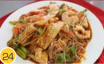
24 Thai Curry Seafood $10.50

Thick rice noodle, beef, egg, vegetable.