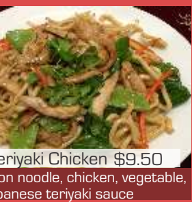
9 Teriyaki Chicken $9.50 Udon noodle, chicken, vegetable, Japanese teriyaki sauce