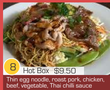
8 Hot Box $9.50 Thin egg noodle, roast pork, chicken, beef, vegetable, Thai chilli sauce