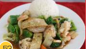
53 Seafood Rice $11.50 Combo seafood, vegetables, oyster sauce, with steamed rice