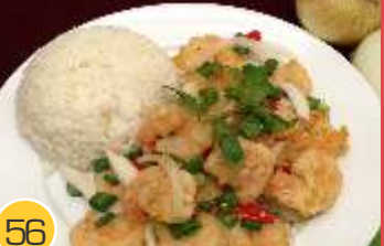
56 Salt & Pepper King Prawn $13.50 King prawn, salt & pepper