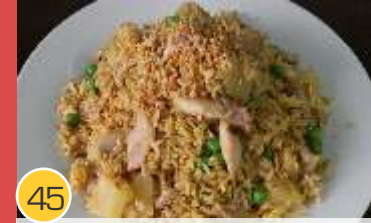
45 Chicken Pineapple Fried Rice $9.50 Chicken, pineapple, peas (containt peanuts)