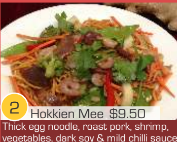
2 Hokkien Mee $9.50 Thick egg noodle, roast pork, shrimp, vegetables, dark soy & mild chilli sauce