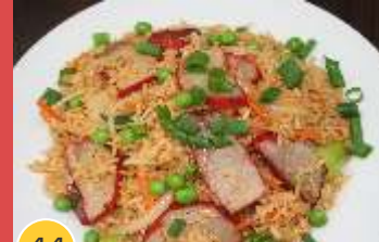
44 Nasi Goreng $9.50 Roast pork, bean shoots, onion, carrots, peas