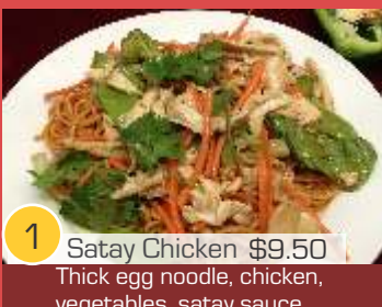
1 Satay Chicken $9.50 Thick egg noodle, chicken, vegetables, satay sauce