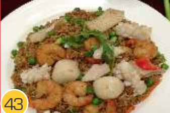
43 Seafood Nasi Goreng $10.50 Combination seafood, bean shoots, onion, carrots, spring onion, peas, Xo sauce.