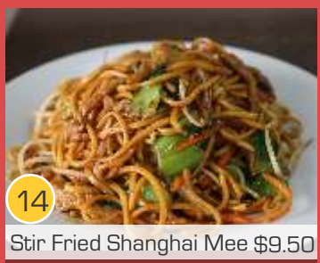
14 Stir Fried Shanghai Mee $9.50 Thick egg noodle, pork, vegetable