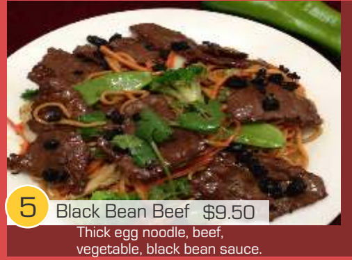
5 Black Bean Beef $9.50 Thick egg noodle, beef, vegetable, black bean sauce.