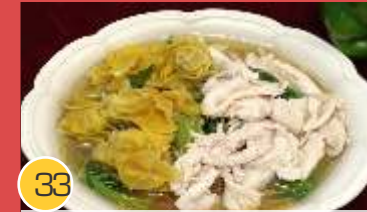
33 Chicken Wonton Mein $10.50

Thick egg noodle, chicken, tofu, vegetable, coconut curry soup