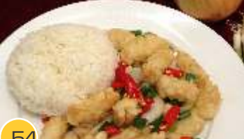
54 Salt & Pepper Squid $11.50 Deep fried squid, salt & pepper