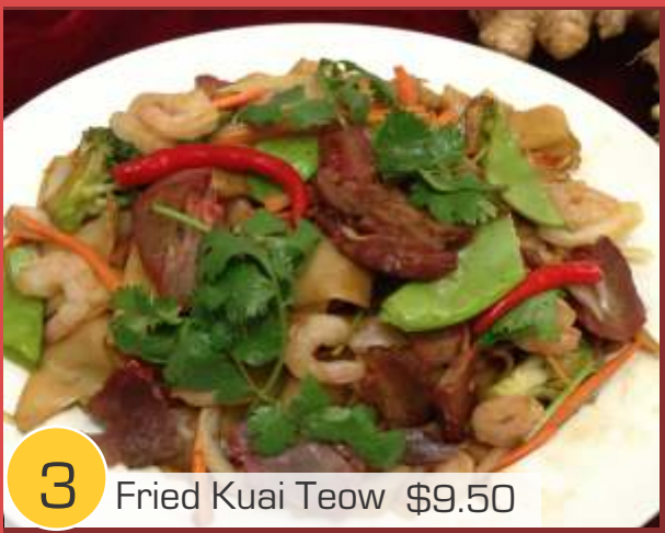
3 Fried Kuai Teow $9.50 Flat rice noodle, roast pork, shrimp, vegetables, dark soy & mild chilli sauce