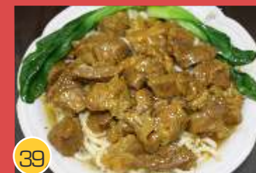
39 Curry Beef Noodle $10.50