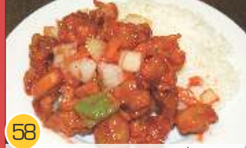
58 Sweet & Sour Pork $10.50 Fried pork in sweet & sour sauce