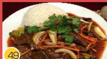
49 Szechuan Chilli Beef $10.50 Beef, vegetable, Szechuan chilli sauce