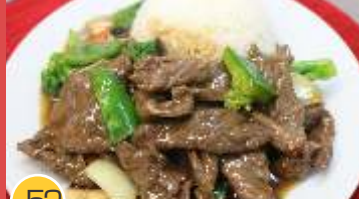
52 Teriyaki Beef $10.50 Beef, vegetable, teriyaki sauce