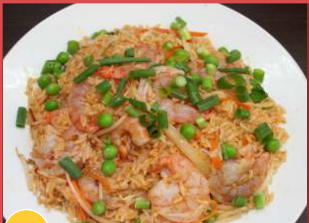
41 King Prawn Fried Rice $12.50 King prawn, bean shoots, onion, carrots, spring onion, peas