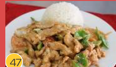
47 Thai Curry Chicken Rice $10.50 Chicken, vegetable in Thai curry sauce, served with steamed rice