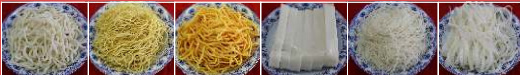
Udon Noodle Thin Egg Noodle Thick Egg Noodle Flat Rice Noodle Thin Rice Noodle Pad Thai Noodle