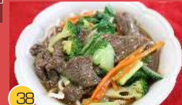
38 Teriyaki Beef Lo Mein $10.50