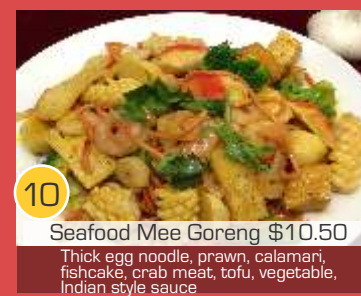
10 Seafood Mee Goreng $10.50 Thick egg noodle, prawn, calamari, fishcake, crab meat, tofu, vegetable, Indian style sauce