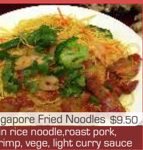
6 Singapore Fried Noodles $9.50 Thin rice noodle, roast pork, shrimp, vege, light curry sauce