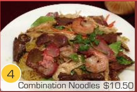
4 Combination Noodles $10.50 Thin egg noodle, prawn, beef, chicken, pork, vegetable, oyster sauce.