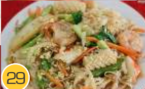
29 Pad Thai Seafood $10.50

Thin rice noodle, chicken, vegetable, Thai spicy curry sauce