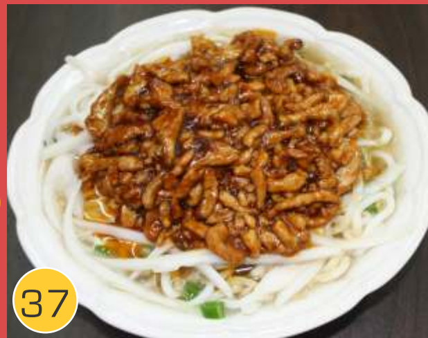
37 Shredded Pork in Sweet Bean Sauce $10.50