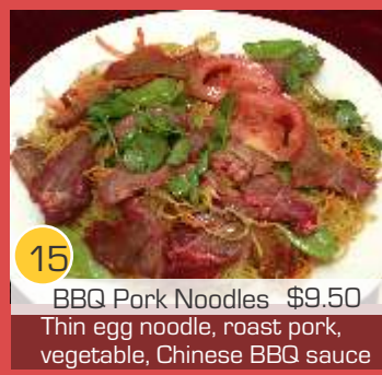
15 BBQ Pork Noodles $9.50 Thin egg noodle, roast pork, vegetable, Chinese BBQ sauce