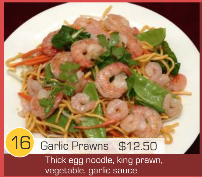
16 Garlic Prawns $12.50 Thick egg noodle, king prawn, vegetable, garlic sauce