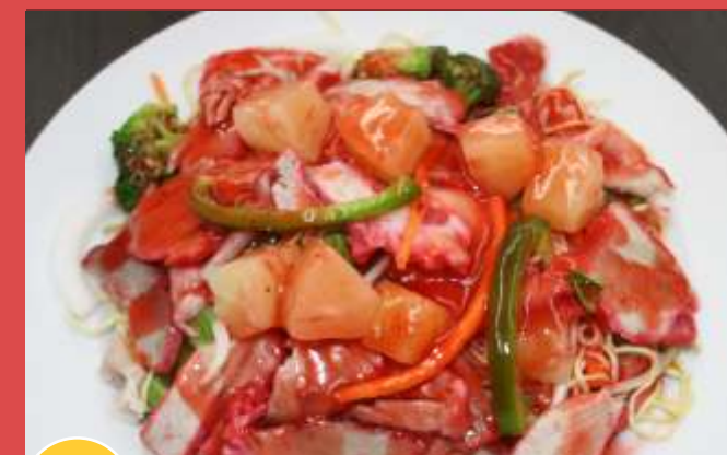
23 Sweet & Sour Pork Fried Noodle $9.50

Thin rice noodle, seafood, vegetable, Thai curry sauce