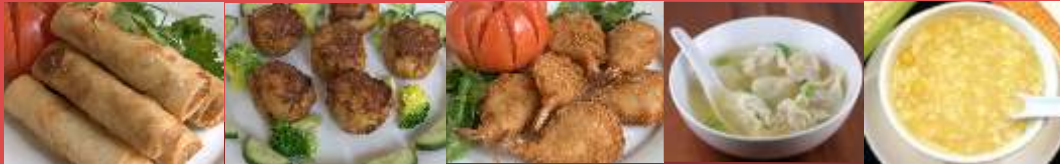
Spring Rolls $1.00/Each $5.00/6 Dim Sims $1.00/Each $5.00/6 Tempura Prawns (6 Per Serve) $5.00 Wonton Soup $5.00 (6 pieces) Chicken Sweet Corn Soup $5.00