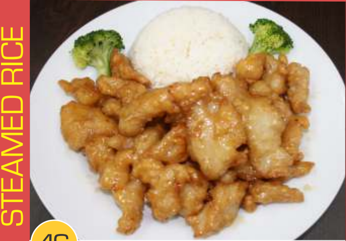
46 Honey Chicken Rice $10.50 Deep fried chicken in honey soy sauce